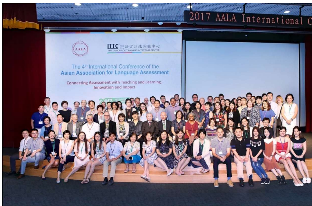
Delegates at the 4th ALAA Conference