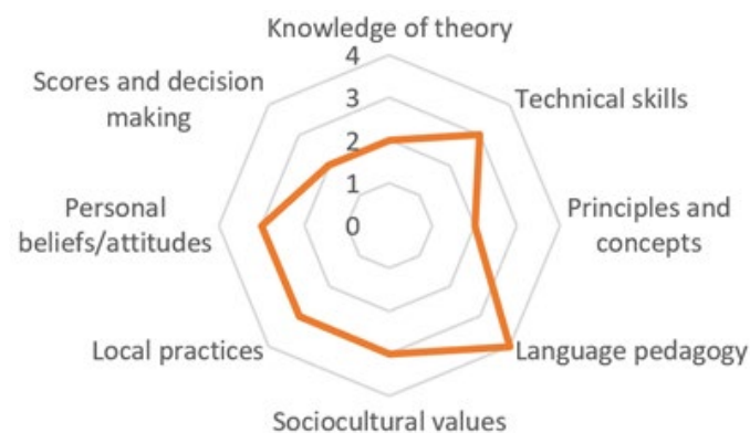
Figure 1. Teacher LAL according to Taylor (2013)

Traditionally, according to Inbar-Lourie (Inbar-Lourie, 2008b), LAL had a strong psychometric orientation, focusing on the knowledge and skills related to traditional language testing. However, the growing focus on formative assessment in the late 1990s opened up the inclusion of more learning-focused assessment components in the descriptions of LAL (Brindley, 2001; Fulcher, 2012). An important development in our understanding of the construct was the shift from more componential notions of LAL (Brindley, 2001; Inbar-Lourie, 2008a) to the view that LAL is multidimensional and evolving (Fulcher, 2012; Pill & Harding, 2013), suggesting that different stakeholders would need various types of knowledge and skills at different levels. Taylor’s (2013) model is a manifestation of this view. It includes eight dimensions which describe various types of skills, knowledge and principles, and five literacy levels, ranging from 0, no literacy required, to 4, very high literacy required. The LAL profile for teachers, illustrated in Figure 1, shows what kinds of levels of proficiency they would need with regard to the different dimensions.